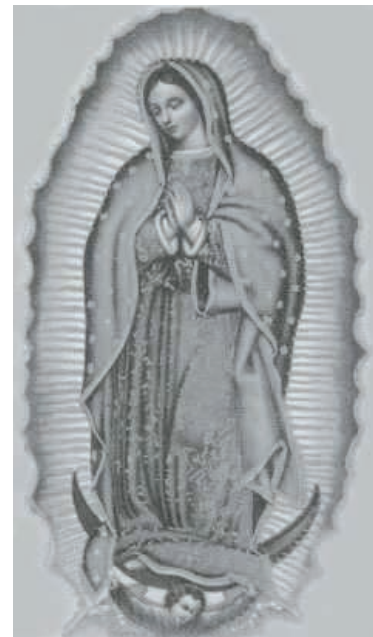
Our Lady of Guadalupe Parish

Arrange at least six months before intended date.